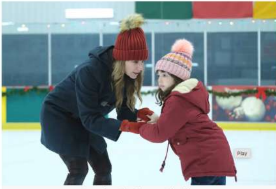
Scene from The Christmas Checklist